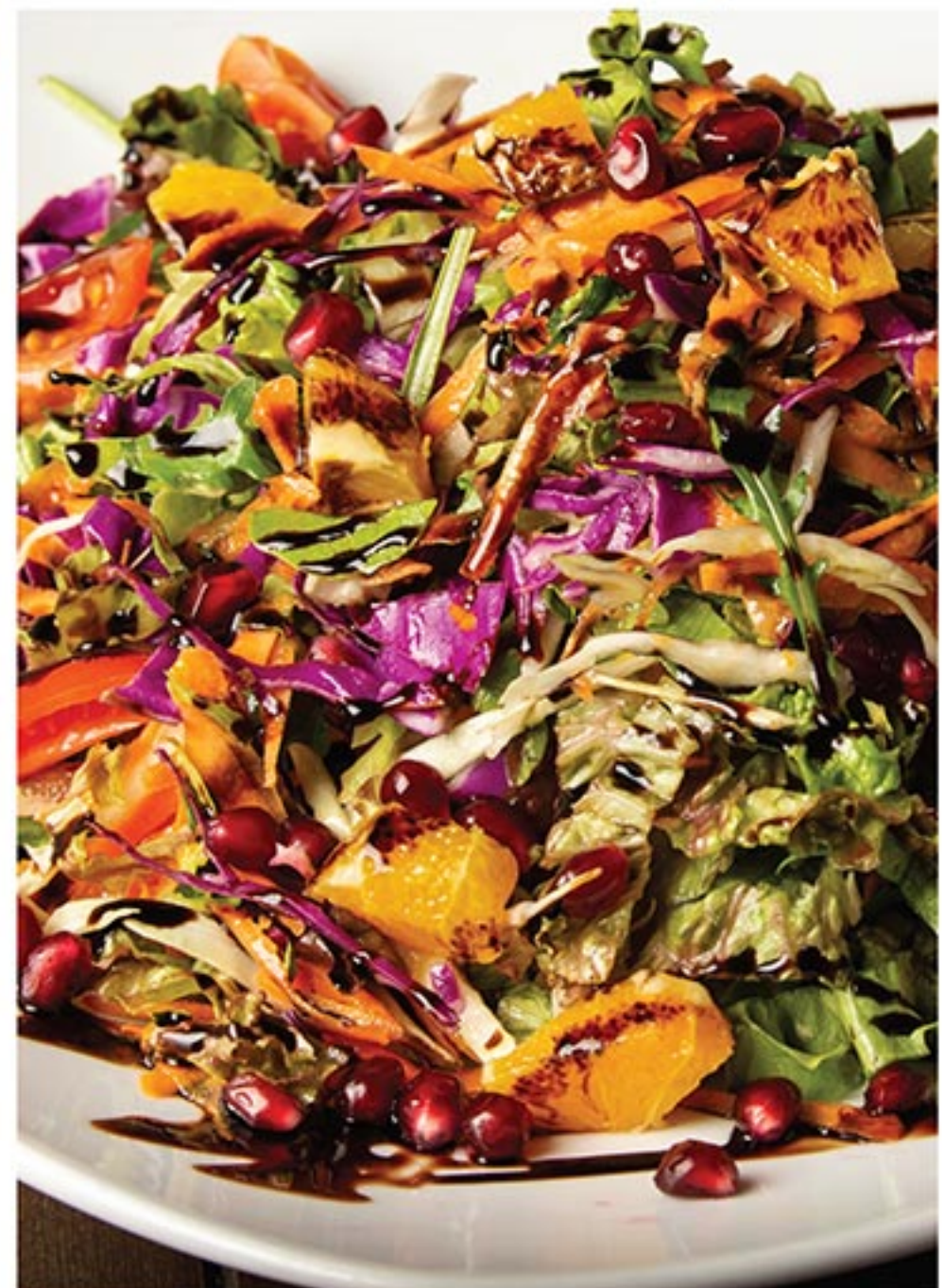
Greek Island salad