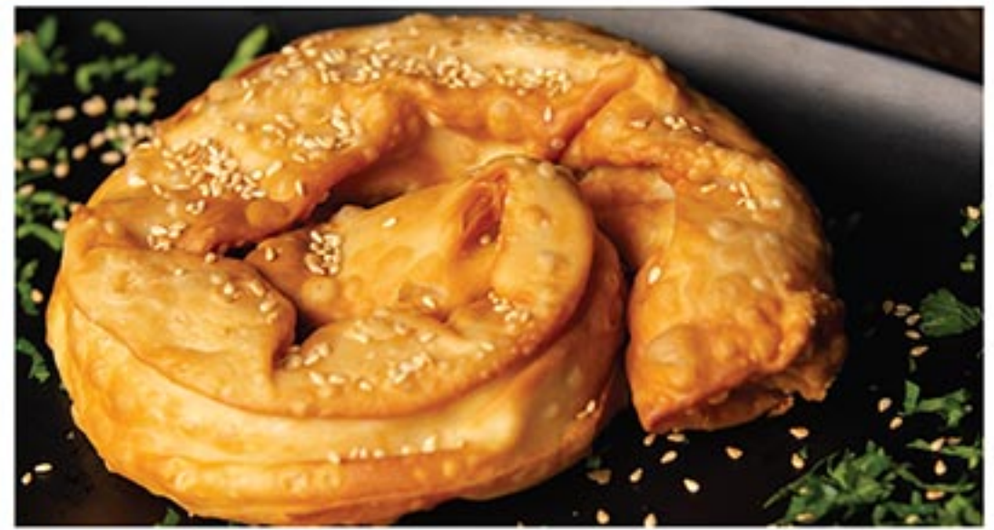
Cheese pie (handmade)