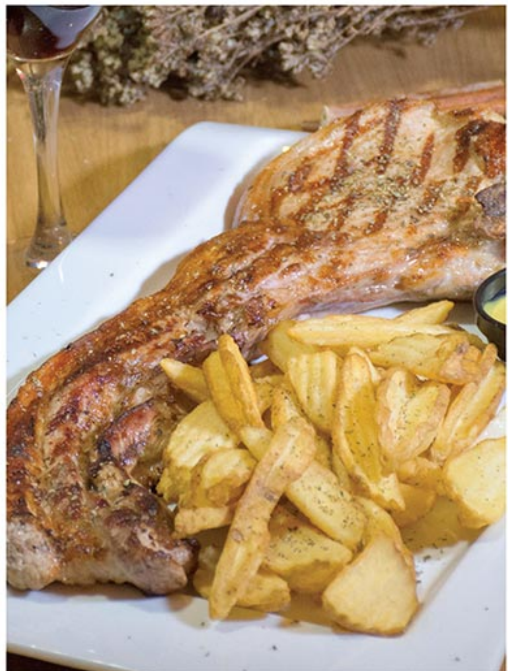
Pork steak XXL