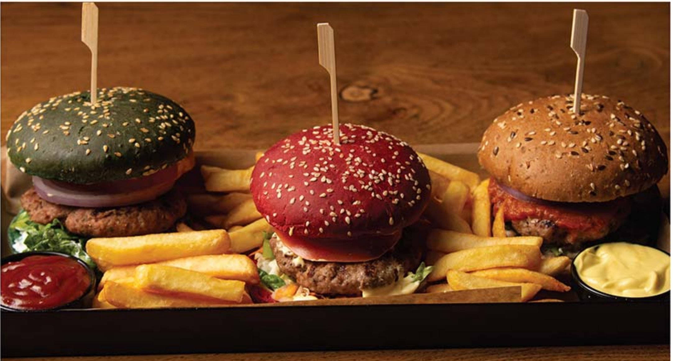
MIX GRILL 4 persons