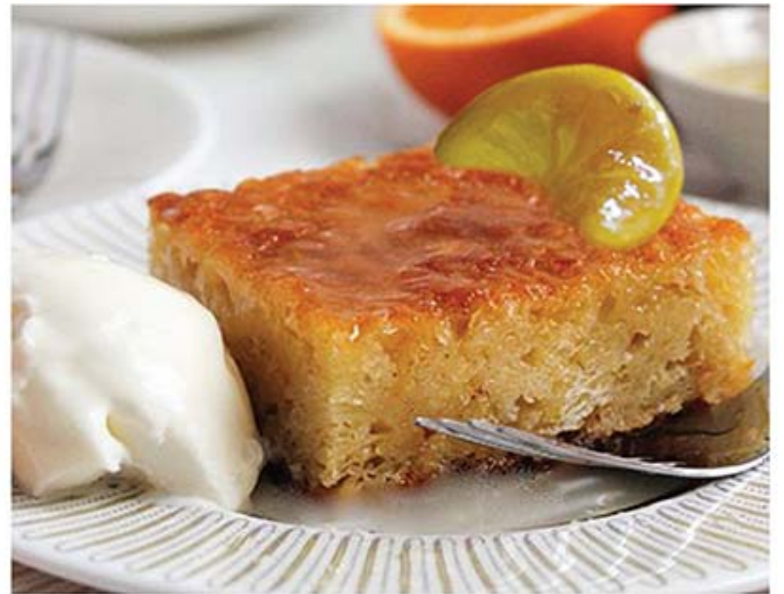
Traditional orange pie