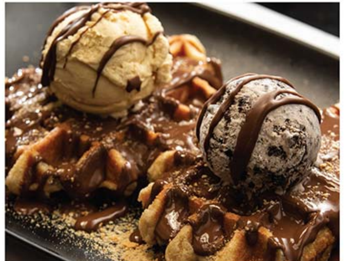
Ice cream waffle