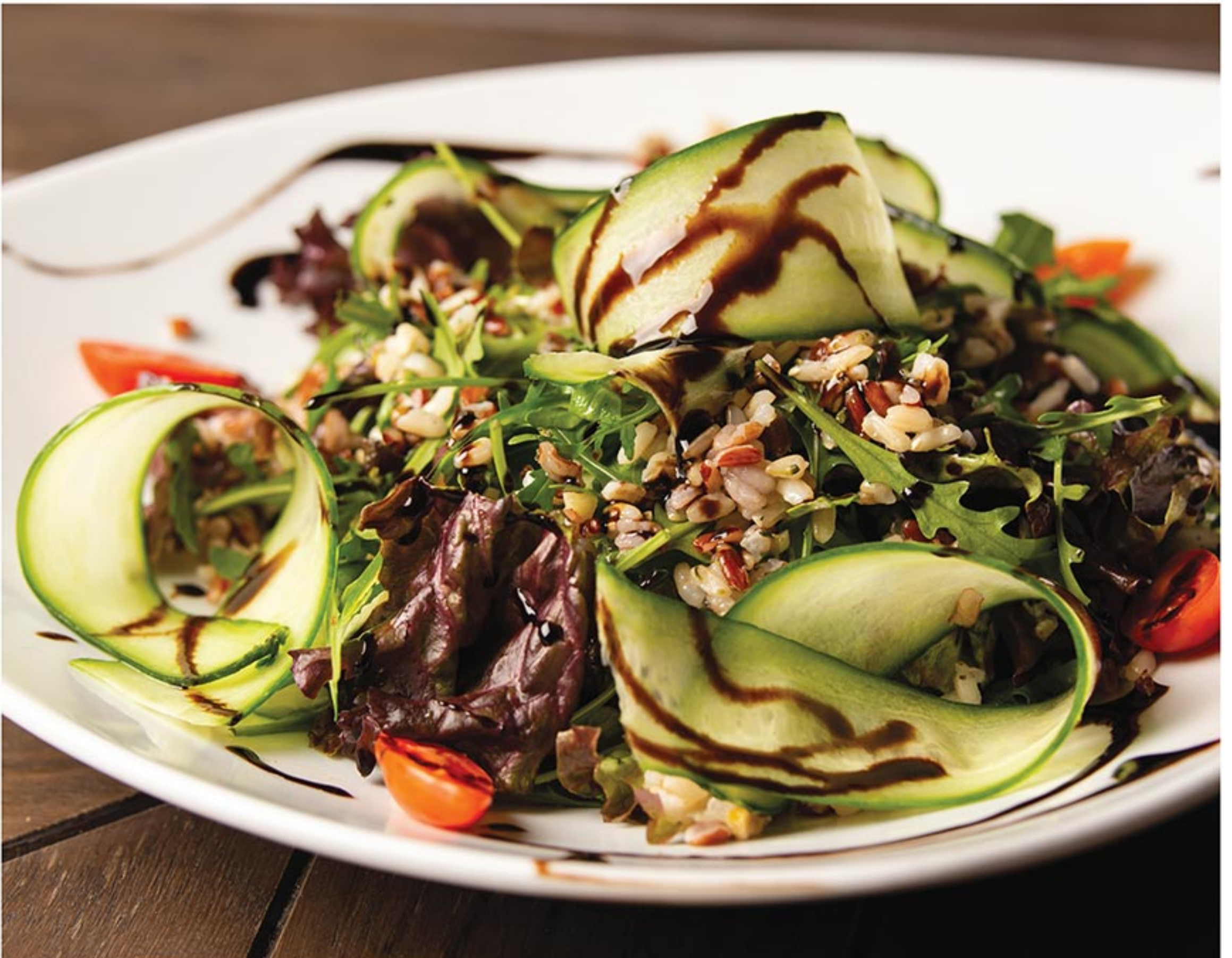
Stormy Aegean Sea Salad