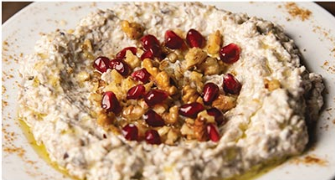
Eggplant salad (baba ghanoush)