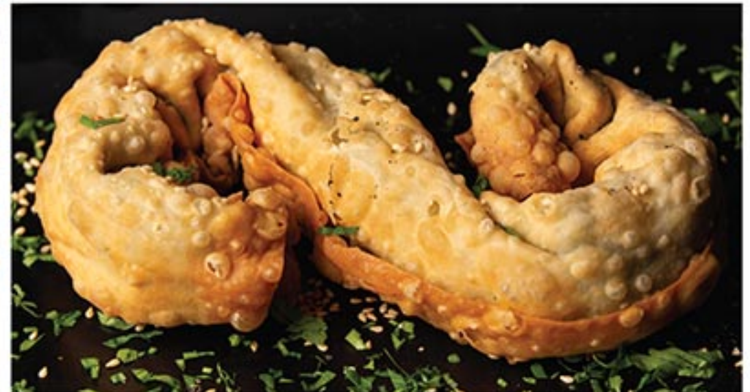
Vegetable pie (handmade)