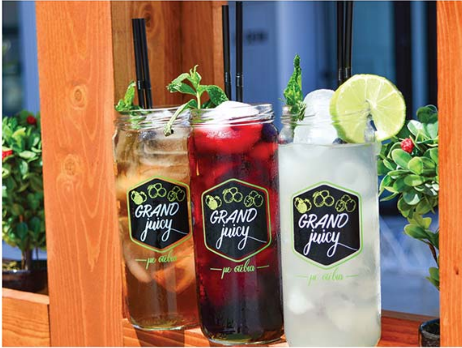
Homemade Ice Tea